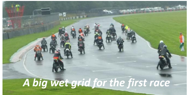
A big wet grid for the first race

Well the morning brought the rain as promised so the anticipated wheel changing got underway whilst breakfast was being rustled up. Scheduled to race 5 th on the program didn't leave much time before timed practice. 17 entries this meeting and being put in with the 1300 superbikes and 1300clubman led to a grid of over 40 bikes, exciting racing on the menu.